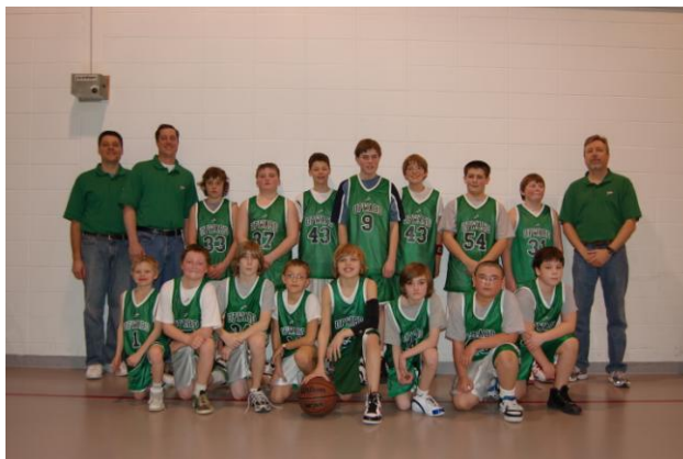
A boys’ basketball team through St. John’s ministry of Upward Sports.