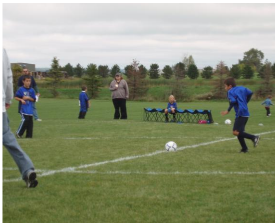
A soccer game through Upward Sports in Union, Ill. 2010

Several years ago, I was exploring various ways of sharing the Good News of God’s love in the community. In my experience at St. John’s Lutheran Church in Union, a rural area northwest of Chicago, I discovered that one of the many things that the Marengo-Union area is passionate about is sports. They love to have their youth participating in sports.